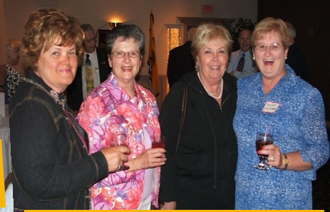
Lions' Ladies Enjoying the Evening.